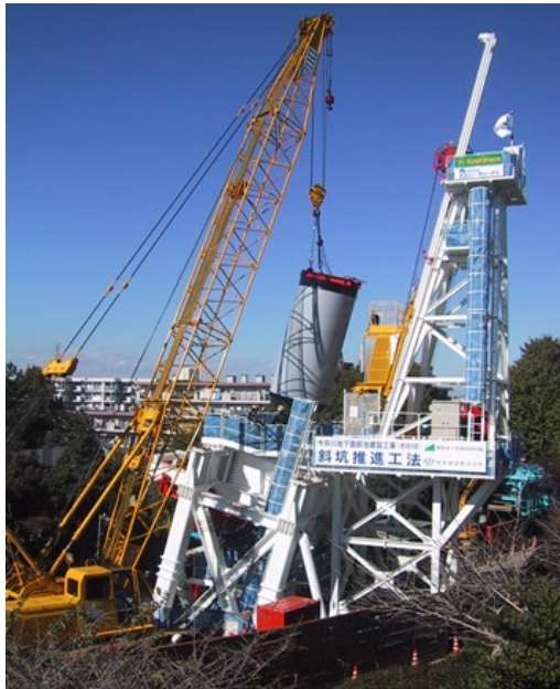
Inclined Shaft Construction Technology