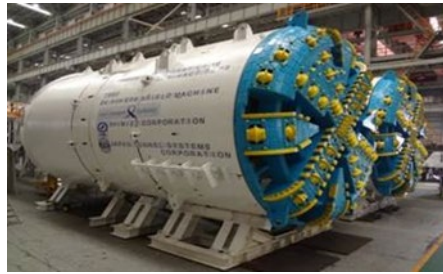
F-NAVI & Underground Construction